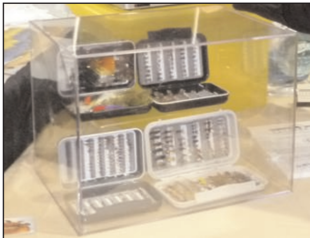
The fly boxes on display at the Fly Fishing Show.

Tickets for the raffle will be sold at our February meeting. ■