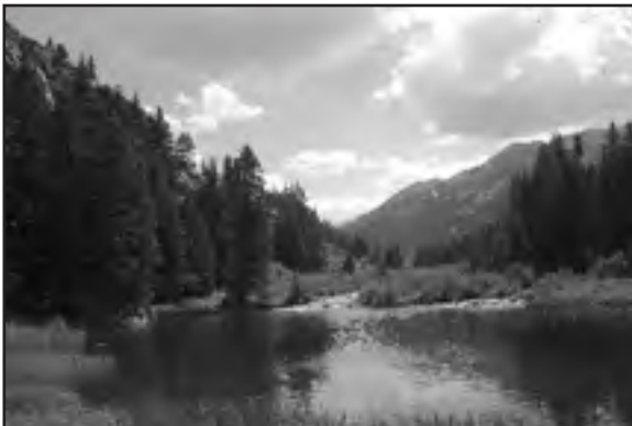
Just one example of the water and scenery available on a Paintrock Adventures pack-in trip.

If this sounds like a great adventure, give Todd and Nancy a call at 307-469-2274 or visit their website at www.paintrock.com . ■