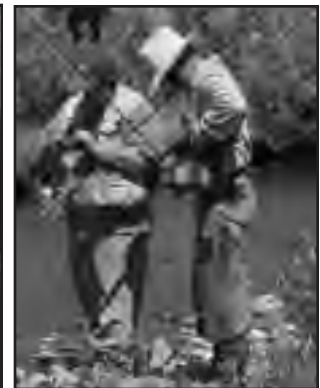
A fishing guide in chaps...