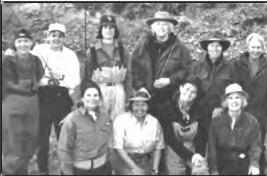
FROM THE CWF ARCHIVES; The title of this photo is “Caddis Hatch 97.” Amazing that Salida is still standing after 14 years. Would you like to be a part of Club history? It is quite simple — take photos of the Club trips you attend and send them to the Editor!

Even though there is no charge for the Annual Club Picnic this year — you must RSVP by July 6th! Time is running out. Don't delay!