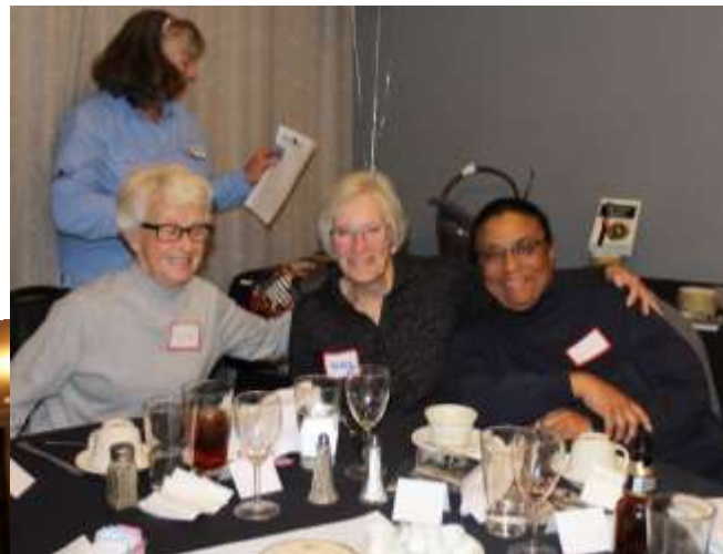
EOS party pics _____

So, stay tuned to exciting events coming up.