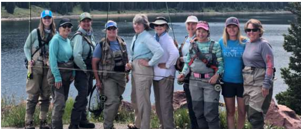
Clinton Reservoir Outing, 7/14/2018